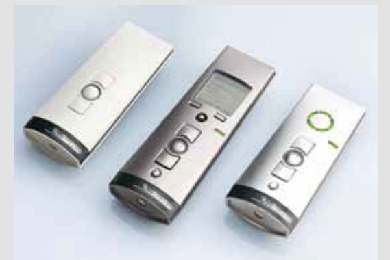
Remote controls Silent Gliss 9940