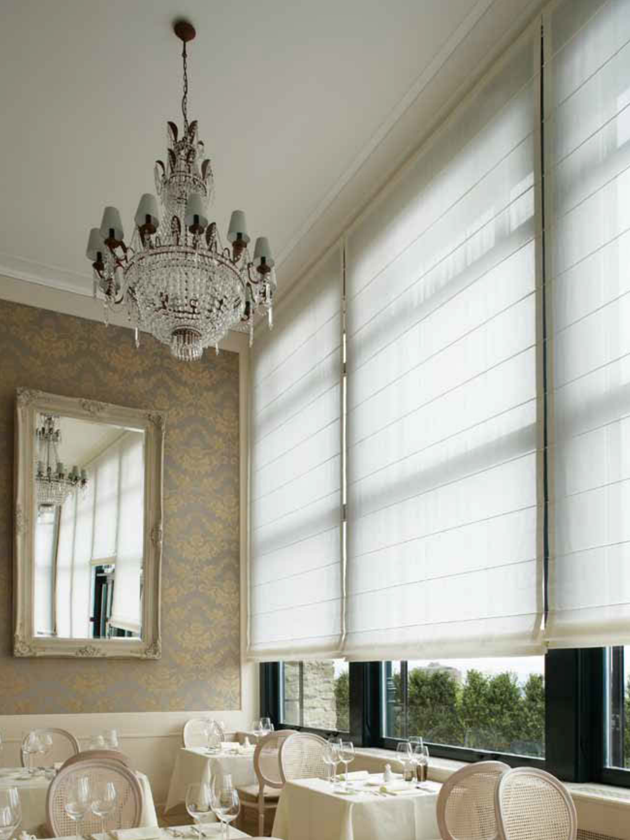
Roman Blind System Silent Gliss 2350