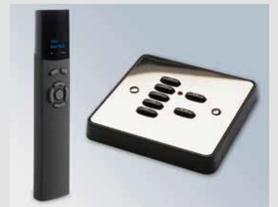
Remote controls Silent Gliss 0450

Our Customer Services team will be on hand from the start to offer expert advice on the most appropriate systems, control combinations and wiring for your project.